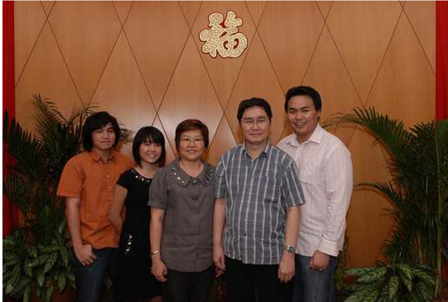
(Left To Right: Brother, Sister, Mother, My Dad & Me)